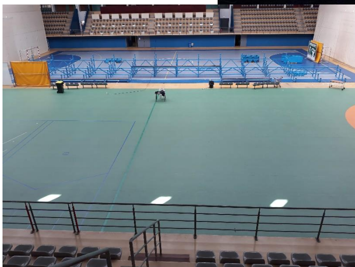
Competition area – Nave de Espinho